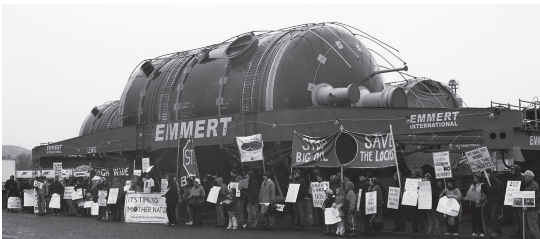
Protesting pipeline shipments in Lewiston, Idaho

They attempted three or four times to block the shipments but the police refused to arrest the two women, instead opting to forcefully remove them to the sidewalk as